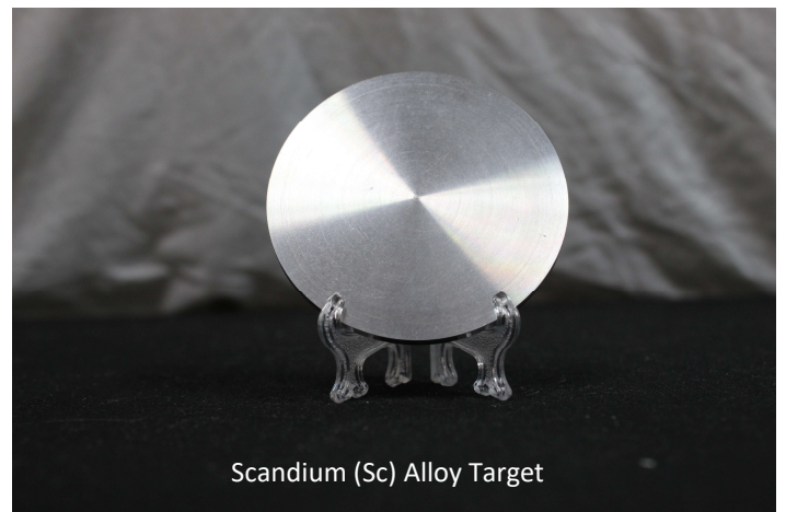
Scandium (Sc) Alloy Target